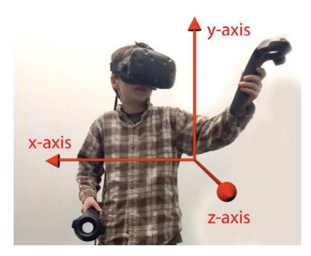
Figure 2. Virtual Reality (VR) coordinate system. In this picture, movement in the y -axis corresponds to moving up and down, movement in the x -axis corresponds to moving left and right, and movement in the z -axis corresponds to moving forward and backward. While global positional coordinates may vary according to set up, y is the up–down direction and the z -axis will often reflect movement towards the monitor of the desktop computer.

see his or her hands represented by an avatar's hands. Positional tracking typically uses external sensors placed around a room that capture the position of the headset and/or additional tracked objects. Such systems allow users to walk around in the virtual space.